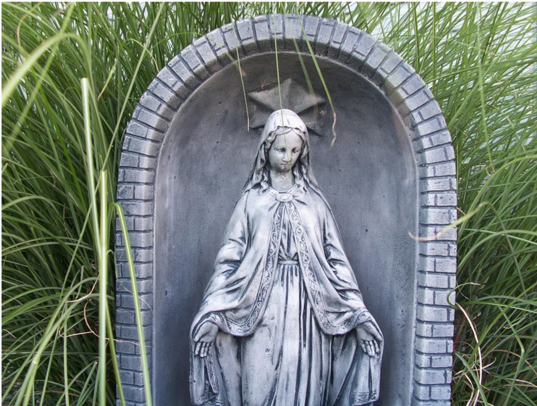
Our Lady Star of the Sea